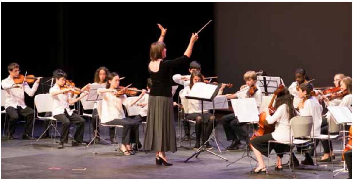
Highlights Concert 2013