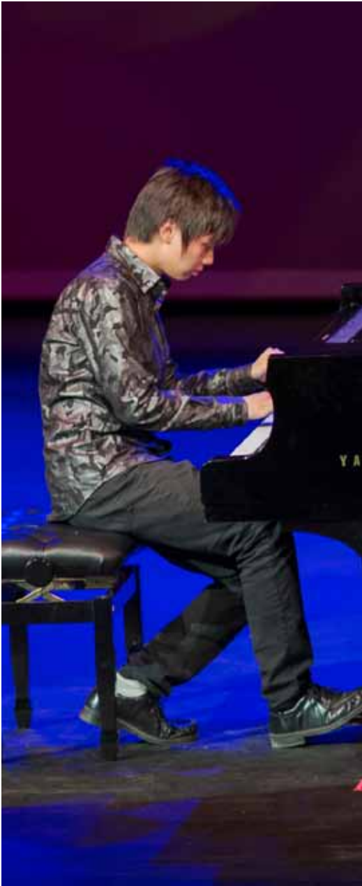
Highlights Concert 2013