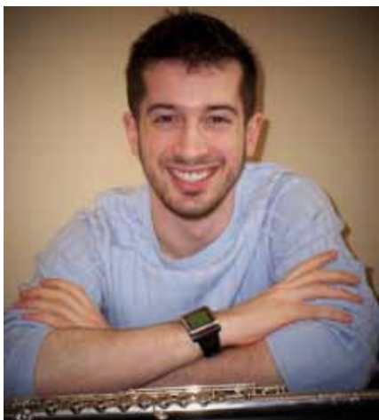
2012 2nd place winner Woodwinds Nationals Music Festivals Competition