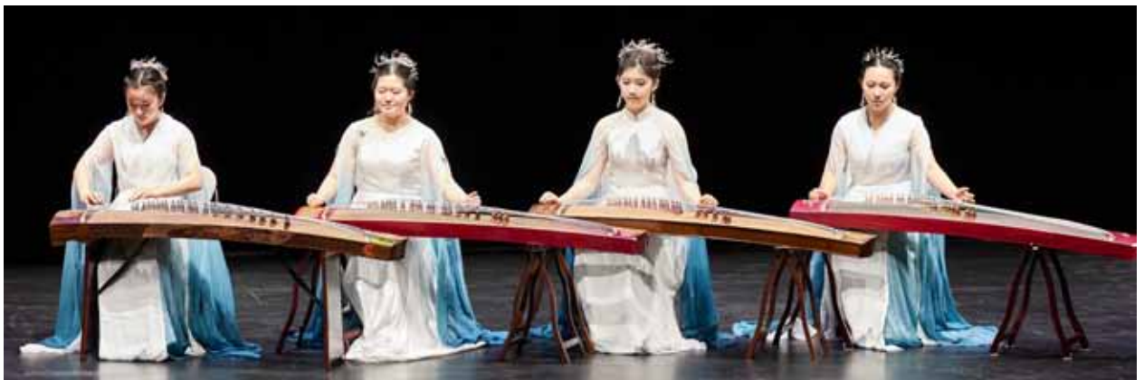
Highlights Concert 2023