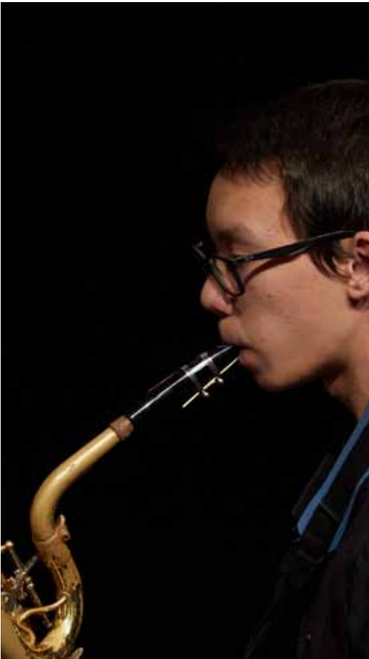
Highlights Concert 2019

Excellence. Talent. Passion. This is what the National Capital Region Music Festival (1945) is all about. With so many alumni success stories and the enormous talent of its annual competitors, the Music Festival has established itself as a well-respected competitive music festival within the National Capital Region and has become the second largest competitive music festival in the province of Ontario!