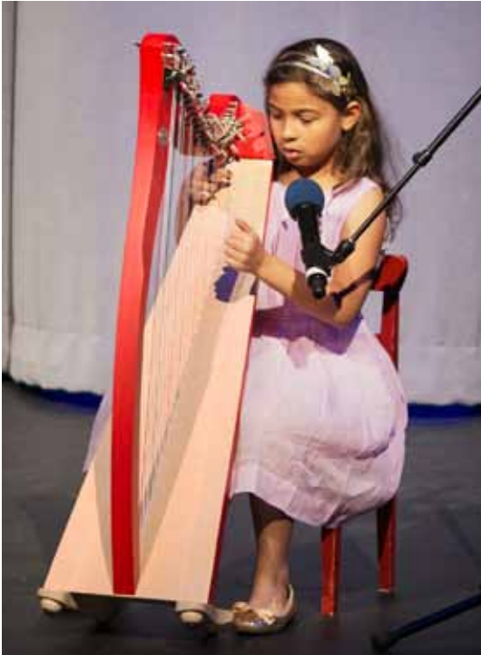
Highlights Concert 2013

An association of dedicated artists and volunteers who collaborate each year to make young musicians' dreams come true!