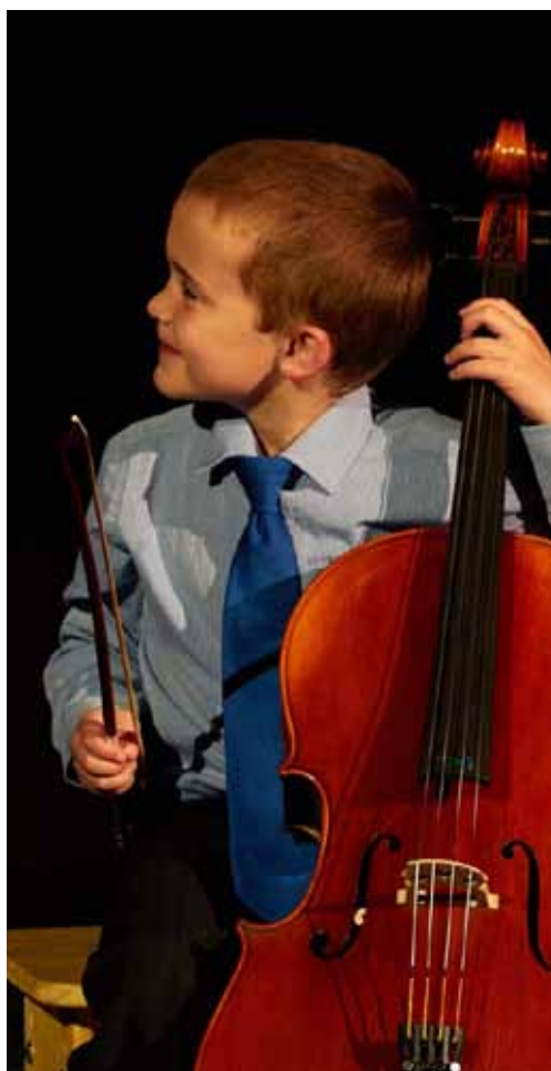
Highlights Concert 2016