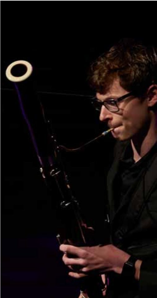
Highlights Concert 2022