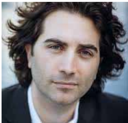
2012 1st place winner Piano Nationals Music Festivals Competition