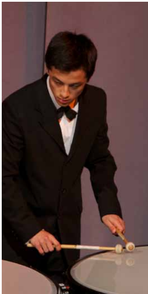
Highlights Concert 2013

Our Festival offers excellent opportunities to promote your business or brand to your desired market. Each sponsorship is a unique agreement that can be tailored to meet your company's needs. Below are the details according to level. Our goal is to build successful, long-lasting partnerships that add value to the sponsorship relationship.